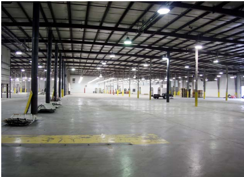
Well-lit production area