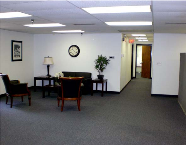
Efficient office design